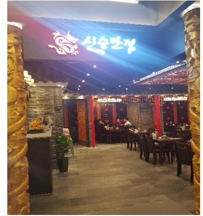
(3) 신승반점 (Shin Seung Banjum) :