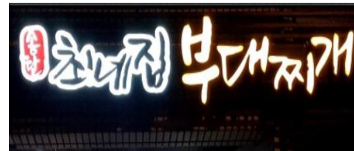
(5) 최네집 부대찌개 (Korean Spicy Stew)