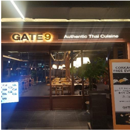
(1) Gate 9 : Thailand Restaurant

NOTE: The coupon has a face value of KRW 15,000 . If you spend more, you should pay the extra charge.