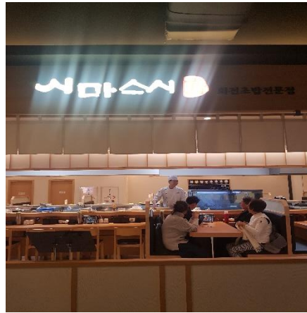
(2) 시마수시 (Shima Sushi) : Japanese Restaurant